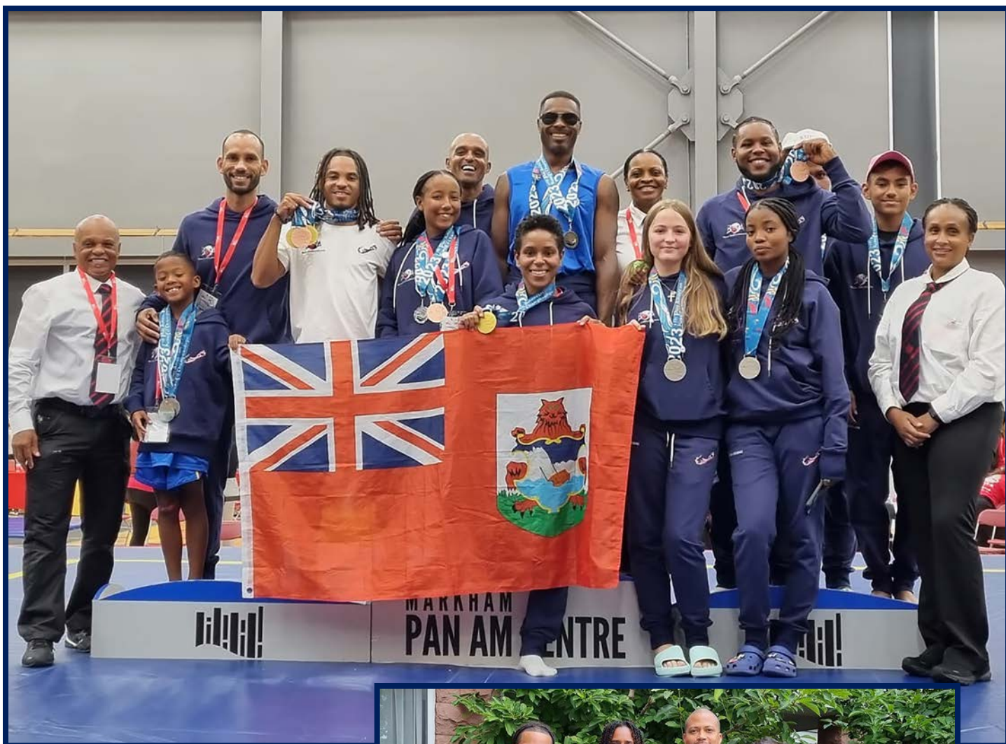
Sanda team at 4th PAKC