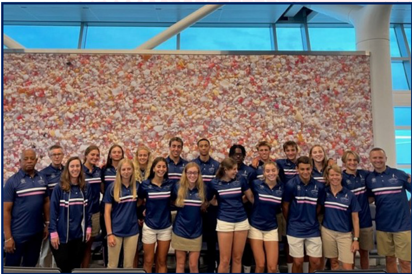
Bermuda Junior Commonwealth Team