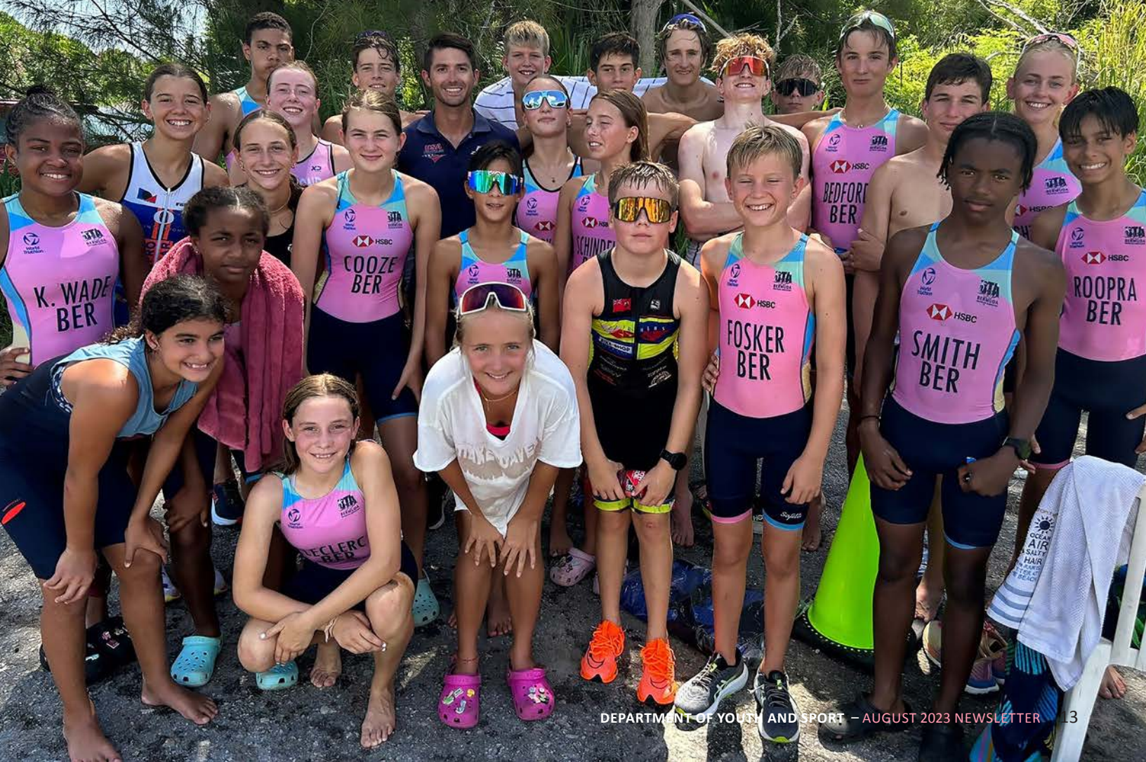
Bermuda Jr. Carifta Triathlon Team